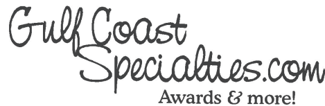
Gulf Coast Specialties